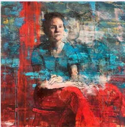
Maker's Hands, 32" x 32". Pastel, charcoal, spray paint, and oil on Arches Oil Paper

This year I had work in several shows. Most exciting was the opportunity to show a piece in New York City through NAWA. I chose to show one of my "Disrupted Military Spouse Portraits" at NAWA's 134 Annual Exhibition. While the piece was too large for a physical appearance, it was the first time they had digital submissions displayed in the gallery. Maker's Hands was chosen. I find it fitting as it was one of my first works in the series.