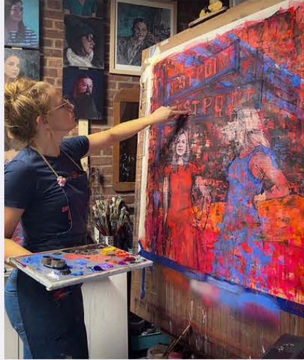
Stations are for Coming and Going, WIP, "41" x 39." Pastel, charcoal, spray paint, and oil on Arches Oil Paper

This all leads to "what is my process?" I mention it in my statement. you can find it on on my website here: