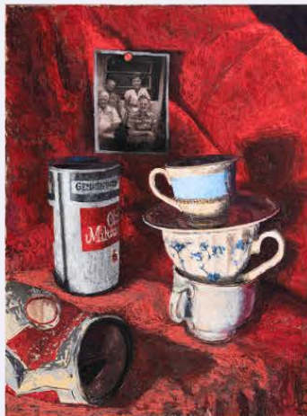
Above- All Our Finery 2: Survivors from the Storm Surge, Pastel on sanded paper, 18" x 24."

I was also accepted into the Pastel Society of America (PSA) . This organization promotes pastels and their unique characteristics. I often see pastels as the underdog of the artworld. However, I can't tell you how much I enjoy working with them.