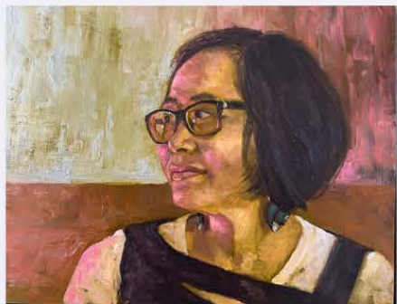
-The Marvelous Ms Mel, Oil on Panel, 11" x 14"